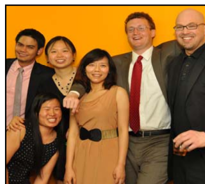
End of the Year Dance Party