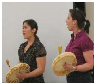
Members of the Swamp Singers